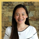
Elecil Nisnisan Western Visayas