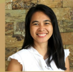
Emadel Cañon Southern Luzon