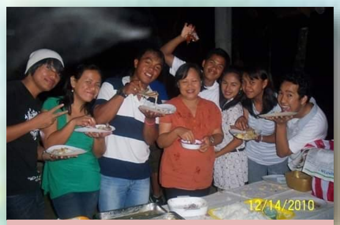
I grow deeper in my relationship with Jesus through my faithful ate's and kuya's in IVCF

My service for God was never easy or perfect. I made bad choices that led to discouragement and frustrations. But through it all, I found and experienced the amazing grace of God. Being in Christ, I have experienced plenty of beautiful and not so good things as well, but in the end, God still works it for our good and joy remains. My life after graduation was very different from my life as a student. I was confronted with the realities of life and I realized it was more difficult without God.