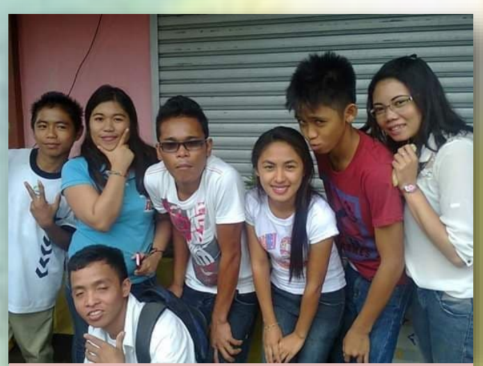
My experience in teaching Out-of-School-Youth through Alternative Learning System grew my love for student ministry